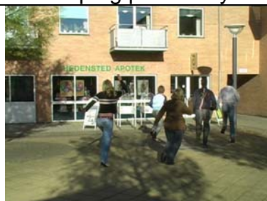
Dancing to the pharmacy