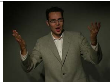
The new Silencexy works!