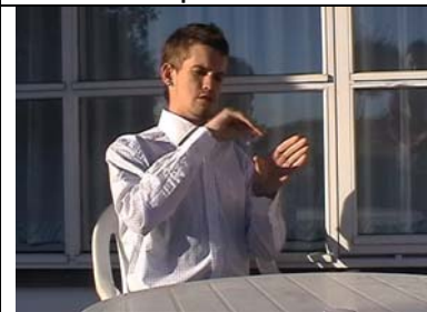
A past patient's experience