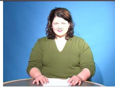
Newswoman in action...