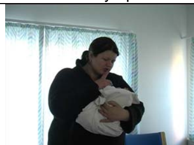
New mother woes