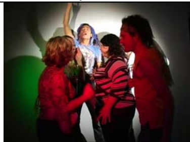
Urlev Dance Club