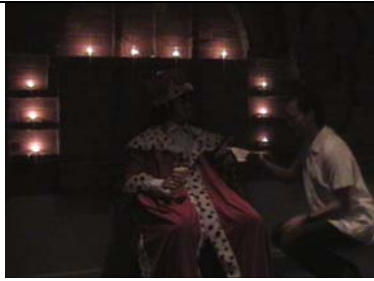
Appeal to the King...