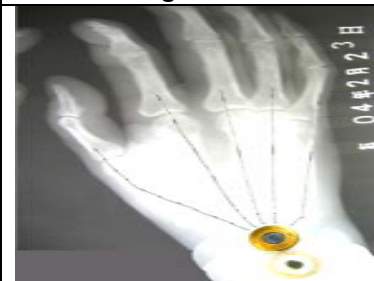
A technological future...