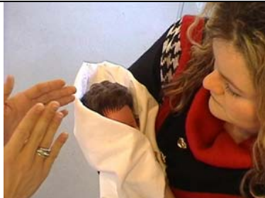
The baby is hearing!