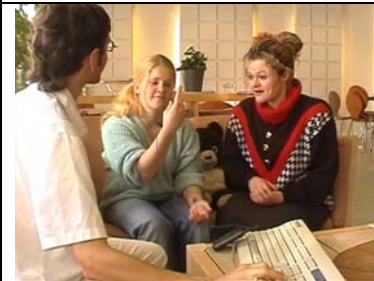
Turning the BHI on...